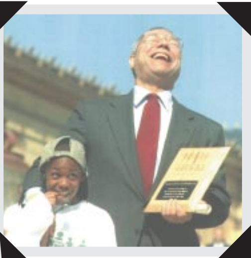
▲ Colin Powell takes in a good laugh with a boy at the HOPE for Kids rally held at the Philadelphia Art Museum on April 19th, 1997.

On April 19th, the HOPE for Kids national outreach saw 29,000 volunteers in more than 50 cities devote nearly a quarter