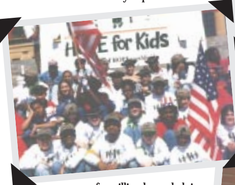
▼ Rosalynn Carter expresses her gratitude to the HOPE for Kids volunteers of the Philadelphia Church of Christ.

of a million hours helping America's children. In a door-to-door canvassing campaign, they educated parents about critical childhood health issues and left valuable information with each family.